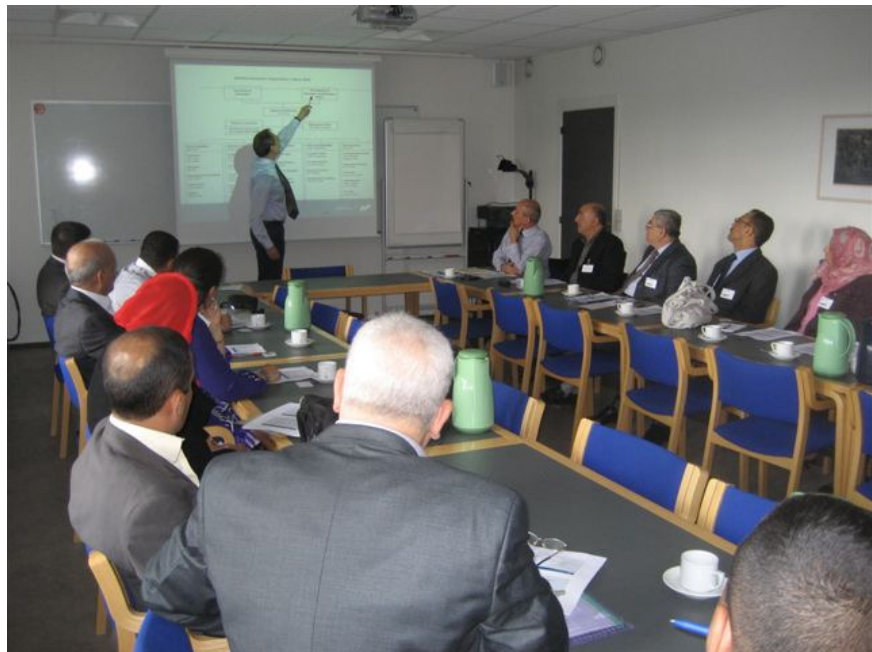
A delegation from the Ministry of Planning of Iraq learn about macro economic planning and forecasting methods.

The delegation's visit to Copenhagen and Statistics Denmark was part of a larger training programme commissioned by the Danish Ministry of Foreign Affairs with the purpose of assisting the Iraqi government in adopting better long term planning methods.