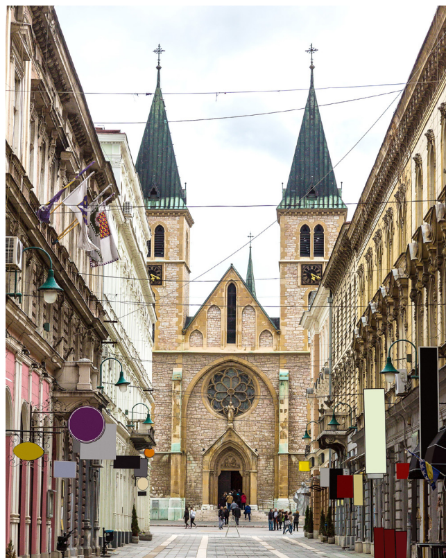
Sarajevo, Bosnia and Herzegovina

The project is the fourth Twinning project between Statistics Denmark (SD) and the partners of National Statistical System (NSS) of Bosnia and Herzegovina. The overall objective is to modernise the NSS and align its products to European standards, thereby underpinning the country's status as an EU candidate country.