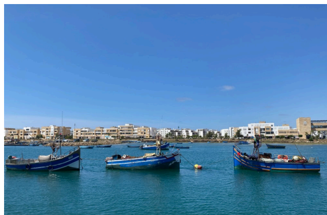
Rabat harbour, Morocco

During 2023 focus will be on finalizing the work done on the quality management system and on IT-security issues. Work will carry on within the components that were initiated during 2022, e.g. the statistical business register, administrative registers and water accounts. In addition activities will continue on setting up user groups to increase user involvement and to identify user needs. In the spring 2023 the plan is to produce some video material on the results in the project up to now and on the statistical business register in particular ■