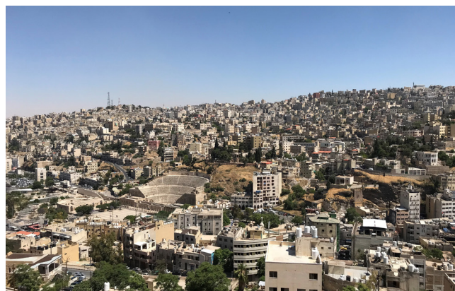
The Roman Theatre seen from the Citadel in downtown Amman

The Twinning project will in 2023 follow the initial work plan approved in late 2022. The achievements of benchmarks and indicators will be followed up closely, and actions will be taken by the project management to ensure implementation of relevant and sustainable solutions for DoS ■