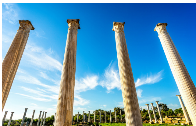
Ancient columns at Salamis, Greek and Roman archaeological site, Famagusta, North Cyprus

To improve statistical actions regarding administrative data sources management and governance, and further develop statistics in the Turkish Cypriot Community.